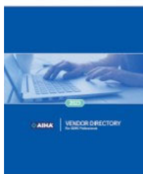
Vendor Directory Browse Now