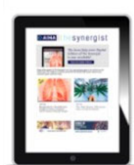
Advertise Media Kit