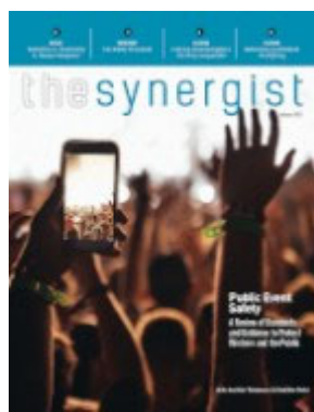
The Synergist Latest Issue